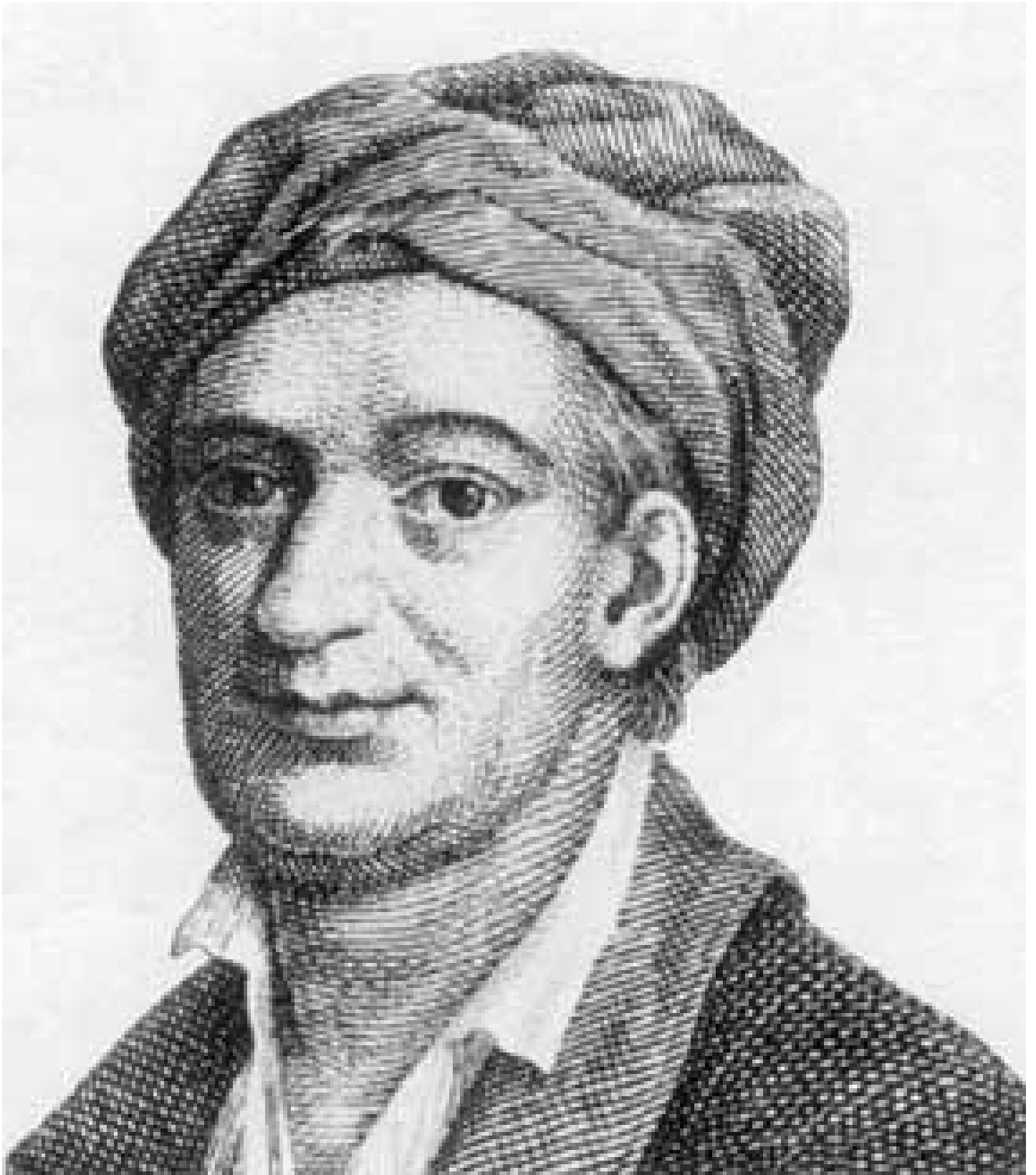
Leibniz 1646 - 1716