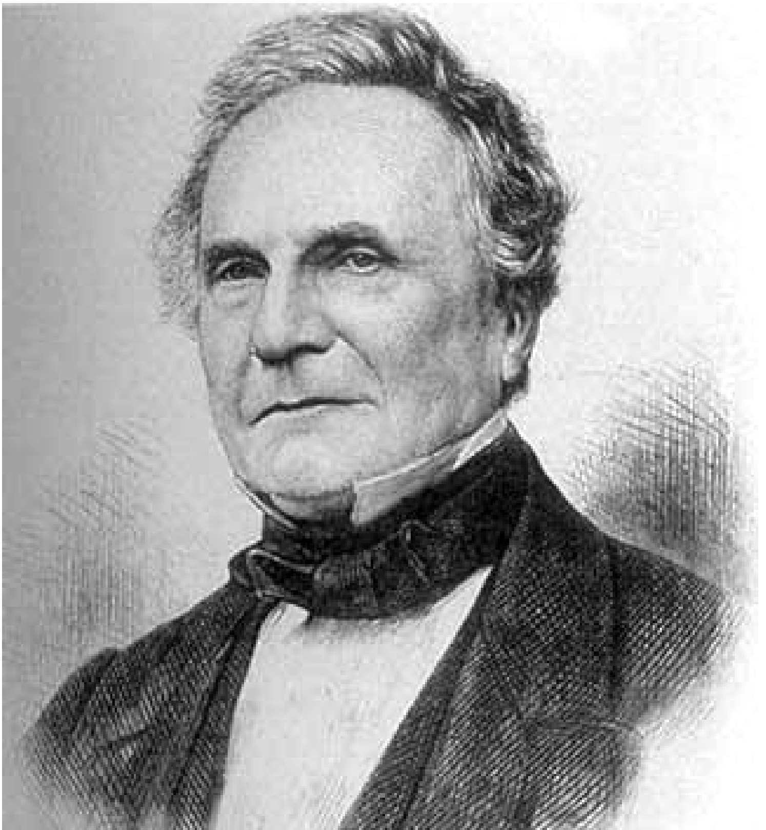
Babbage 1791 - 1871