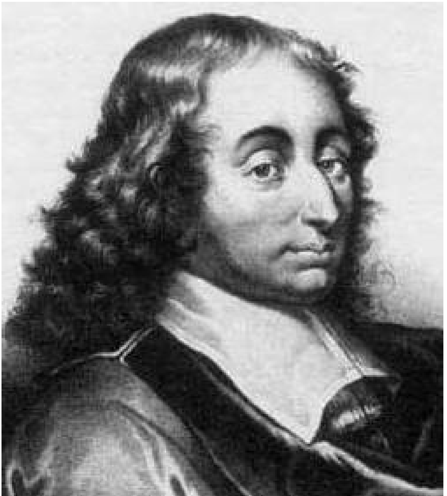
Pascal 1623 - 1662