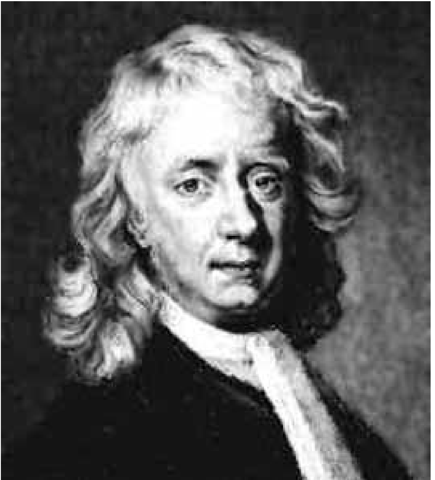
Newton 1642 - 1727